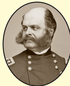
Gen. Ambrose E. Burnside

Union Gen. Alvan C. Gillem's cavalry force marching from Bulls Gap met