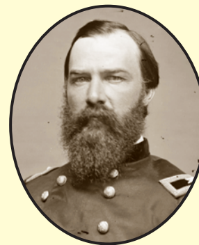
Gen. Alvan C. Gillem